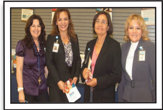
The PACE Admissions Team

St. Paul's relies on community awareness of PACE. In late 2013, the State "Dual Eligible" program will be launched and seniors with Medicare and Medi-Cal will have to join a managed care health care plan. St. Paul's PACE will be an option for eligible seniors. It is important to communicate this new health care messaging to the San Diego community. We must be sure that seniors know what PACE is and what PACE can do for them.