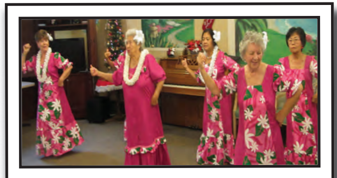
Hula Dancers Perform for McColl Health Center Residents