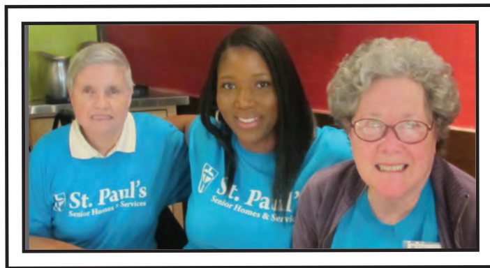
Participants and Activity Coordinator Enjoy Benihana Restaurant

Do you know a senior in the community that could benefit from a social, flexible, and fun "day program"? Call today to learn more about St. Paul's Intergenerational Program. It's specifically tailored for seniors with mild stages of memory loss. Our intimate and affordable day program serves lunch, can help with transportation, and brings joy to seniors and caregivers alike. Learn more by calling (619) 239-6900.