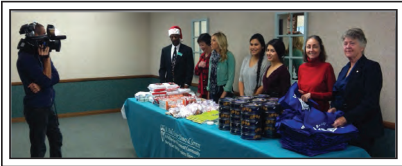
LUV, Morgan Stanley, and San Diego Trust Bank Volunteers on Fox 5 San Diego