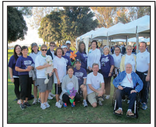
St. Paul's Staff, Residents, and Family Gather for Walk to End Alzheimer's Disease