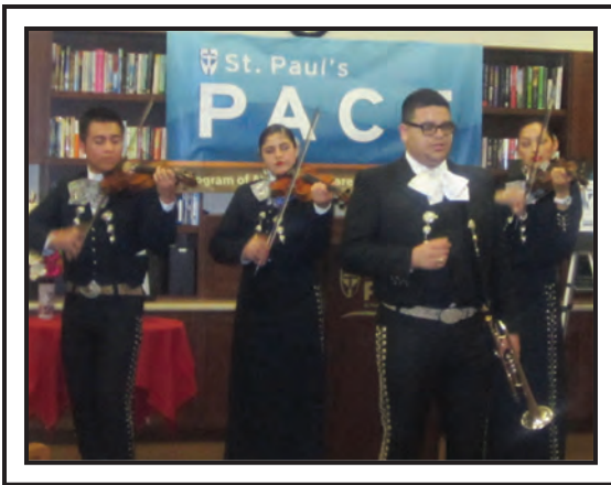
Local Mariachi Performers Entertained the Audience