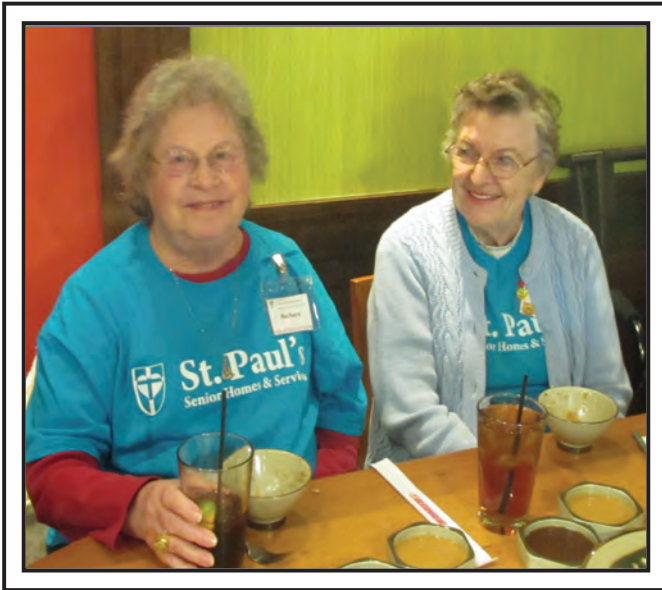
Senior Day Participants enjoy lunch at Benihana's Restaurant