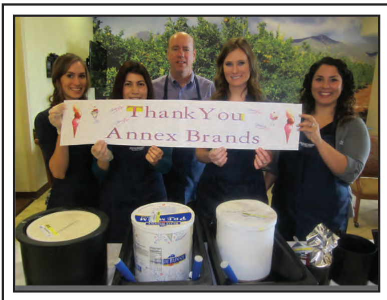
Ice Cream Fun! Annex Brands employees showcase a Thank You sign after serving ice cream to the PACE Seniors