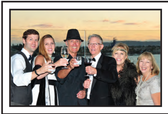
LUV Gala Guests Raise Their Glasses