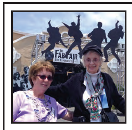
Senior Day Participants at the San Diego County Fair