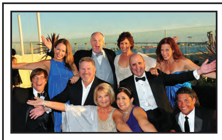
Guests from Presenting Sponsor Secure Transportation Enjoyed the Sunset Views During the Reception