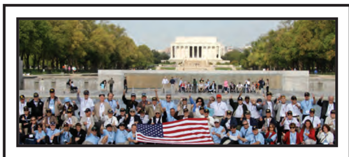
A Group Picture at the WWII Memorial