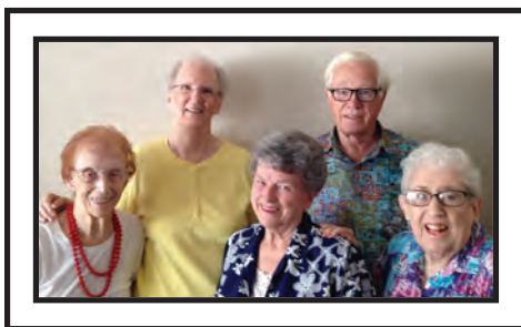
The 2014 Manor Resident Association Board