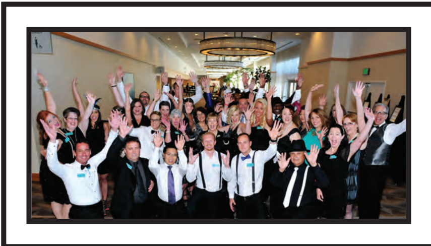
Volunteers and the LUV Gala Committee Did a Fantastic Job Planning and Producing the Event