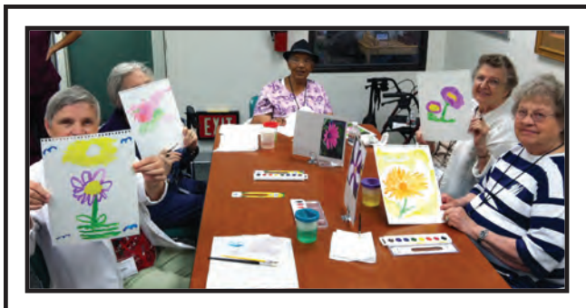
Senior Day Participants Show Off Their Artwork