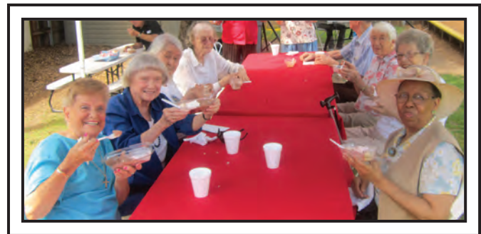
Union Bank Employees Served Ice Cream for Delighted Manor Residents