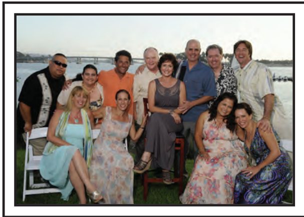
Secure Transportation Staff and Friends