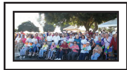
Team St. Paul's at the 2012 Walk

Seniors in St. Paul's programs and communities have varying stages of Alzheimer's disease. Our goal is to have Residents, Participants, staff, and family members walk and show their support for the seniors we serve and the community at large.