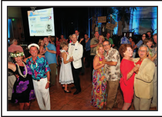
Dancing the Night Away!