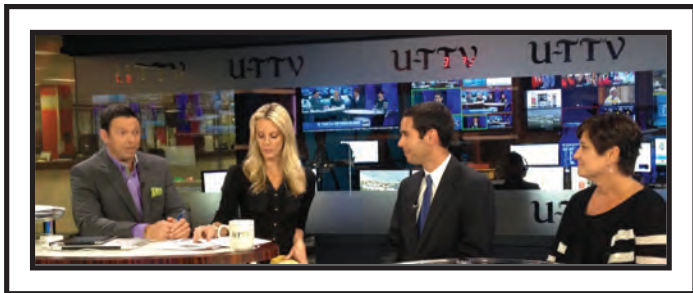
The McColl Health Center is Profiled on UT-TV for Another 5 Star Rating Rating from US News & World Report