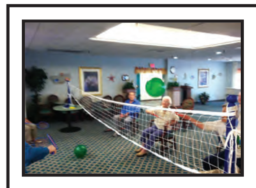
Villa Residents Participate in Balloon Volley