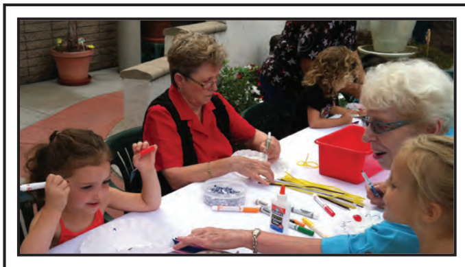
Children and Seniors Working Together on an Arts and Crafts Project

commemorated the occasion with ice-cream, live music, and food! Union Bank employees volunteered and served the delicious ice cream.