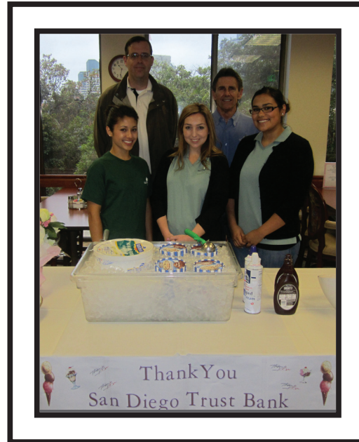
San Diego Trust Bank Employees serve Ice Cream at PACE Reasner Center