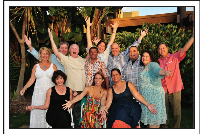
Secure Transportation Employees Having a Blast!