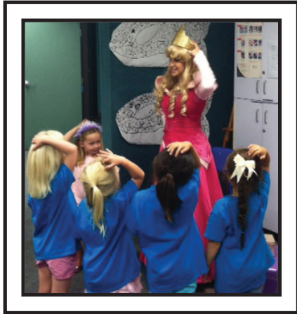
Princess Aurora Stopped by for a Special Birthday Party in the Childcare Program