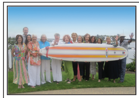
2012 LUV Gala Committee

After all was said and done, the Endless Summer of LUV was a fun and entertaining evening for all, but most importantly, we raised funds for the expansion of St. Paul's PACE in the South Bay. Thanks to all of the supporters of the event, including Sodexo Senior Living , the 2012 LUV Gala Presenting Sponsor. Because of the strong support from our friends in the community, St. Paul's LUV Gala raised more than $140,000 this year! What an amazing show of support!