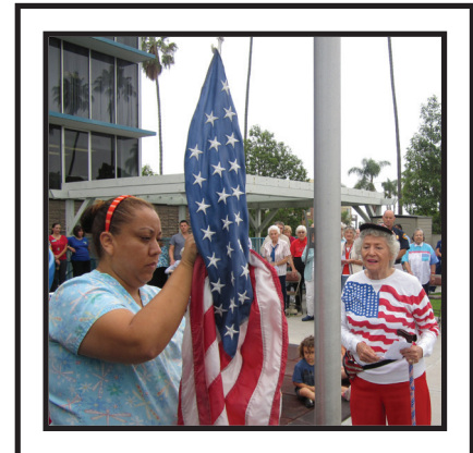
Staff, Residents, Participants, Children and Community Members Commemorate the 9/11 Anniversary