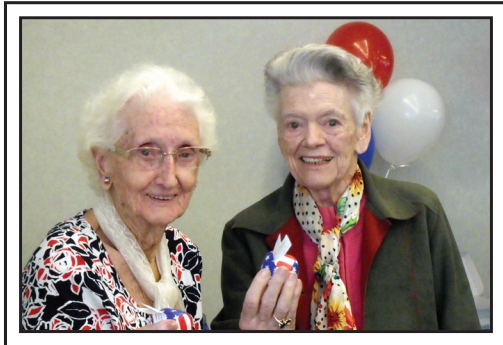
4th of July fun at the Villa