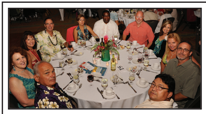
Guests from Presenting Sponsor, Sodexo Senior Living