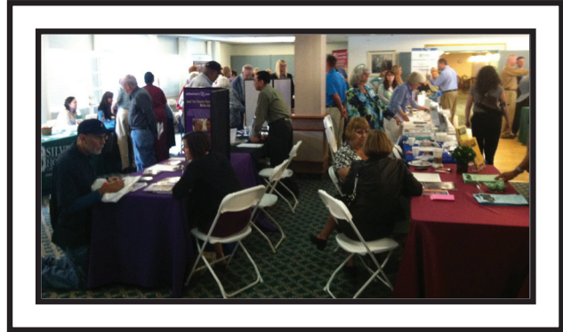
Vendors and Participants Interact