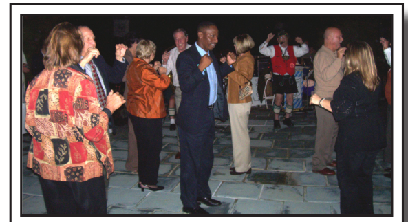
No Oktoberfest would be complete (or as much fun) without the infamous chicken dance.