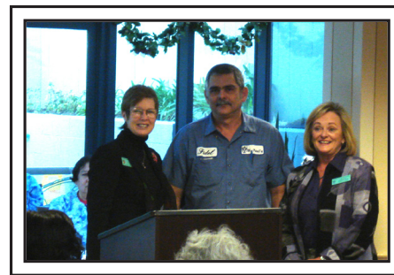
Employees are recognized by the Residents and St. Paul's administration for their service and attention.

While there is never a shortage of activities going on throughout St. Paul's, there seems to be a special event going on almost daily during the holidays. From Hanukkah, Christmas and New Year's Eve celebrations at each community, to the Child Care Holiday Program and Employee Recognition, the spirit of the season is always present.