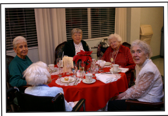
St. Paul's Residents discussing the evening's festivities.