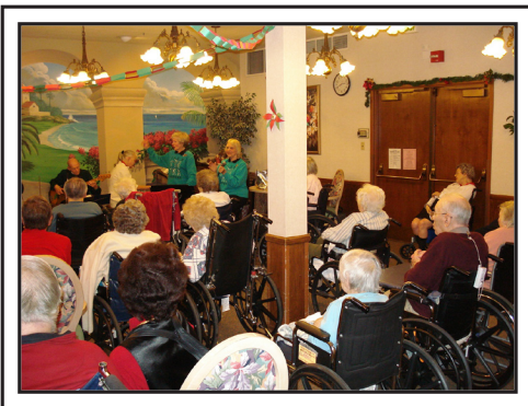
McColl Health Center Residents enjoying the sounds of the holidays as the lively band plays old favorites, all-time classics and the holiday songs everyone loves.