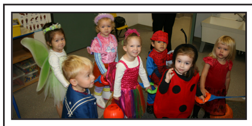
From the Halloween Costume Parade (above) to pony rides (below), petting zoo and barbeque, St. Paul's Child Care Program celebrated Halloween and Fall in grand style.