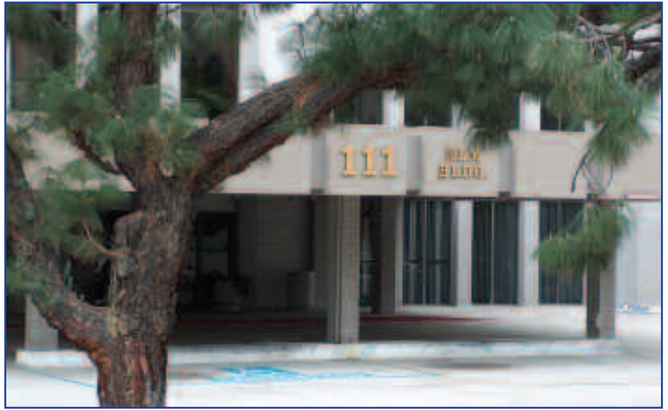
The entrance of the new PACE facility, St. Paul's Pavilion, located at 111 Elm Street.

Over five years ago, St. Paul's initiated a campaign to bring a Program of All-inclusive Care for the Elderly (PACE) to San Diego. It has been a long process – similar to running a marathon: purchase a building to serve as the PACE Center, acquire a PACE license from the state, and build an operating reserve to underwrite startup expenses until Medicare and MediCal reimbursements begin to cover our costs.