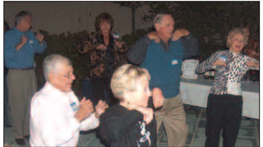
No Oktoberfest is complete without the Chicken Dance.