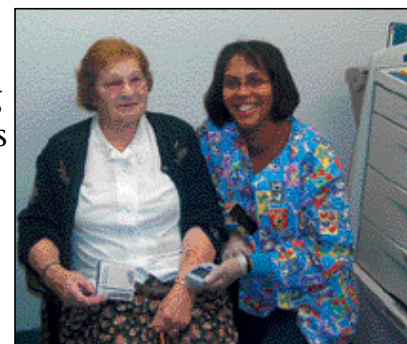
New nurses' station

St. Paul's Villa, the assisted living facility of St. Paul's Senior Homes & Services, underwent a major renovation last year, mainly due to the generous contributions from the Anonymous Donor Foundation and numerous donors.