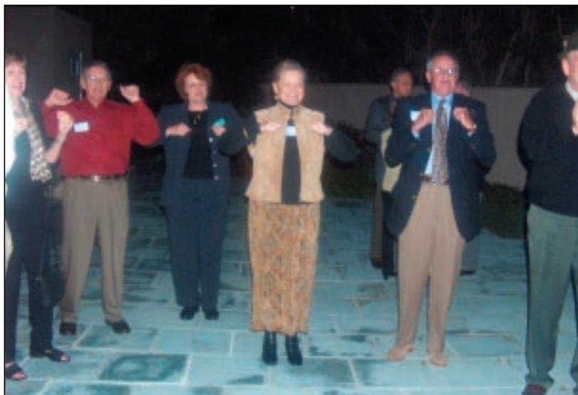
Oktoberfest revelers do the Chicken Dance.