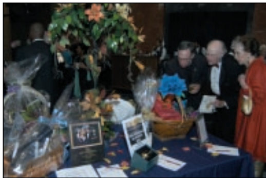
Gala attendees browse the Silent Auction tables